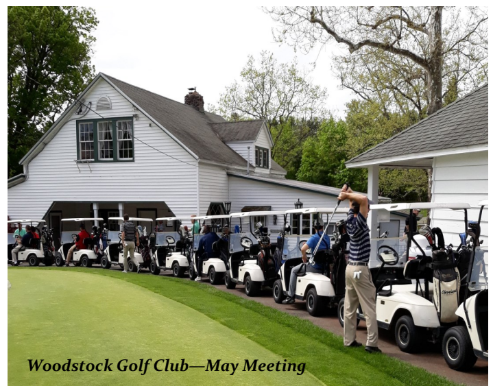
Woodstock Golf Club—May Meeting

Beekman Golf Course Wednesday, October 10, 2018