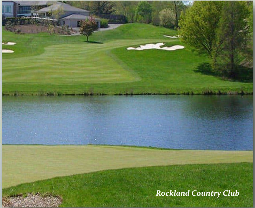
Rockland Country Club