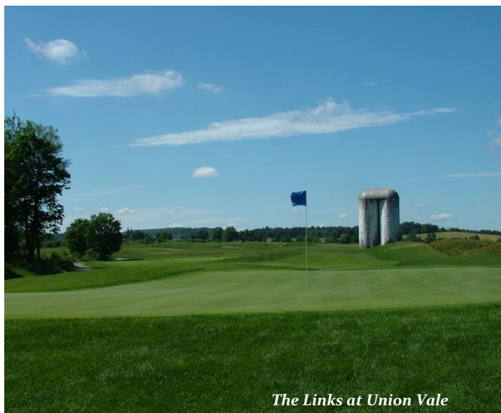
The Links at Union Vale