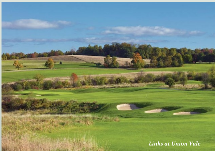
Links at Union Vale

The Hudson Valley Golf Course Superintendents Association exists to inform, educate and serve members within the Hudson Valley and surrounding areas.